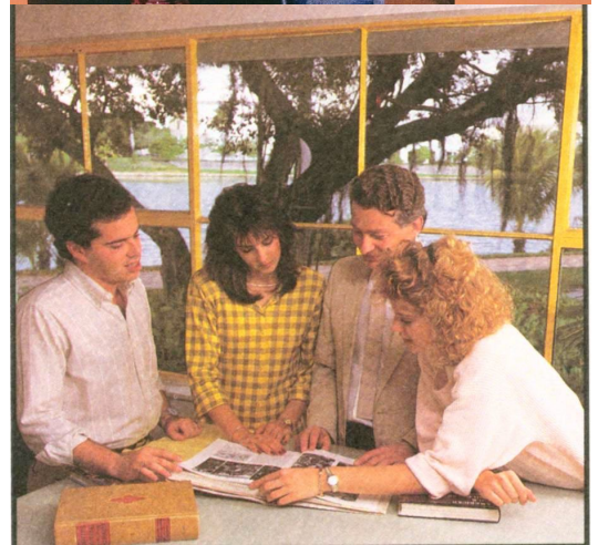
As Interim Dean with students, 1983